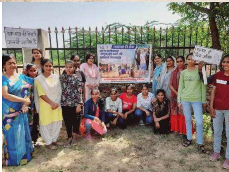
SWACHTA JAAGROOKTA RALLY AND NUKKAD NATAK IN ROOPANGARH