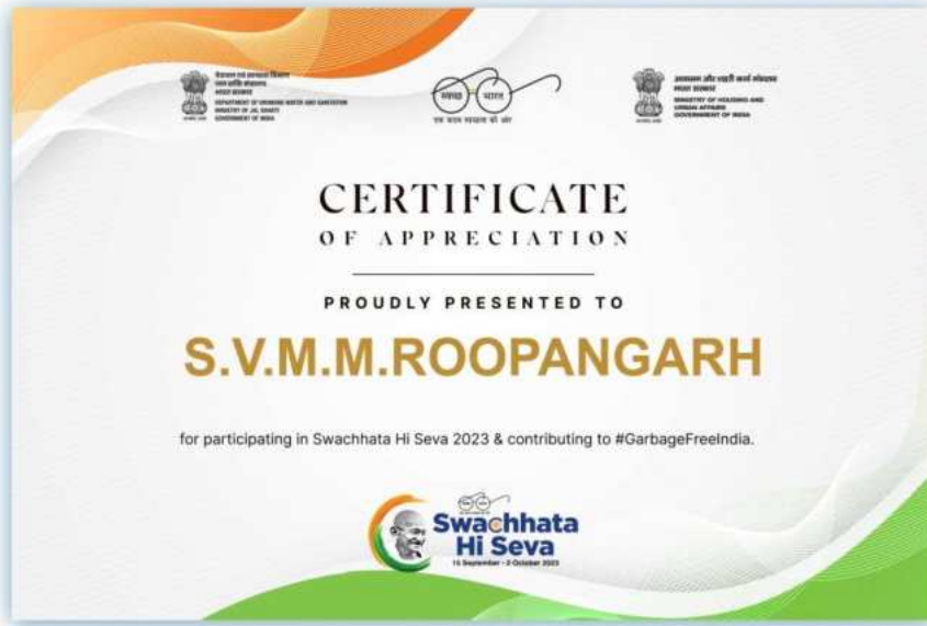
Certificate of Swachhata hi Seva