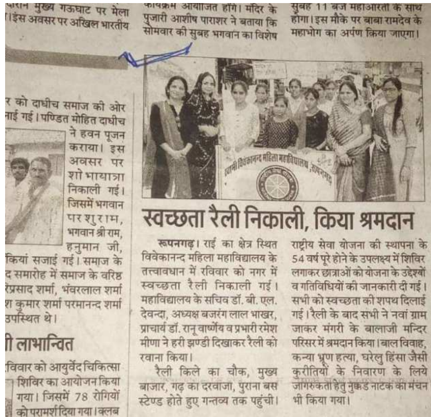
PRESS NOTE REGARDING SWACHHATA NEWS

Digitally signed KOMAL PAREEK by KOMAL PAREEK Date: 2024.04.17 11:57:55 +05'30'