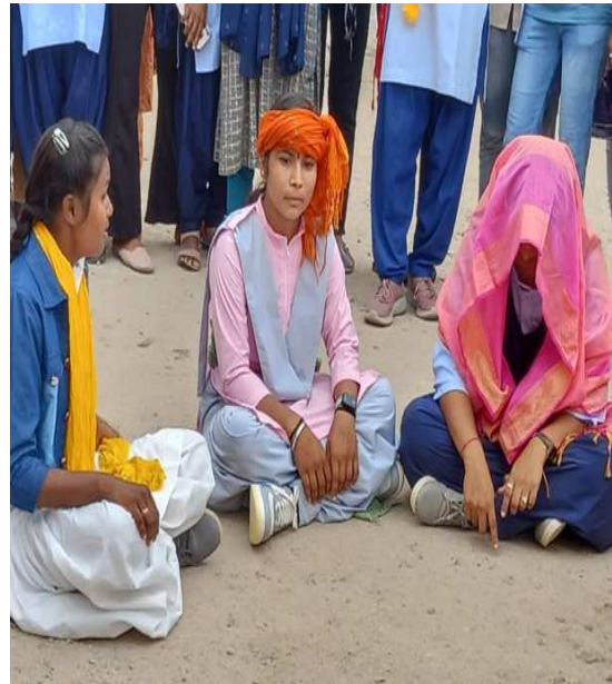
NUKKAD NATAK IN ATAL CHOCK, ROOPANGARH

KOMAL PAREEK Digitally signed by KOMAL PAREEK Date: 2024.04.17 11:57:43 +05'30'