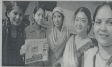
Glimpse of door to door visit