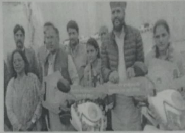
Students receiving Scooty